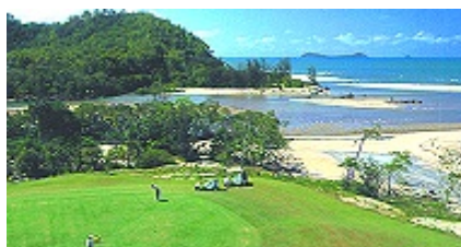
Half Moon Bay Yorkeys Knob