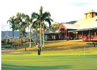
The Links Port Douglas

The Golf Passport includes four games of golf. Two rounds at any of the championship courses included in the passport in the region, and 2 rounds at any of the public courses in the area. If you require a personalised passport this can certainly be arranged.